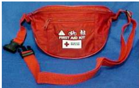
Lifeguard First Aid Kit $12.00