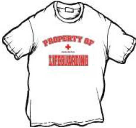
Property of Lifeguarding T-Shirt $12.00