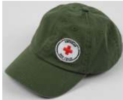
American Red Cross Ball Cap Vintage Green $15.00