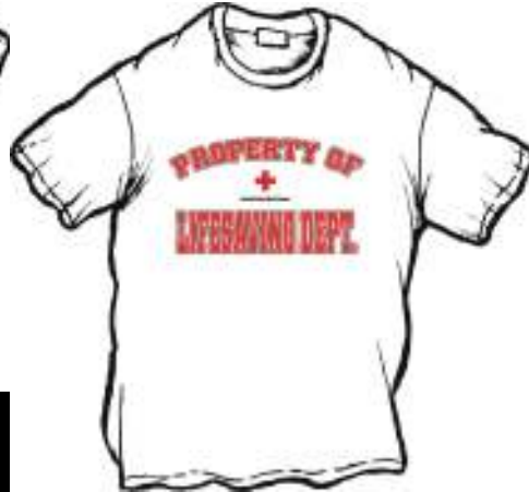
Property of Lifesaving Dept. T-Shirt $12.00